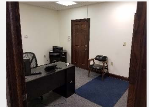
2 nd Floor Common Area, Corner Office, & Reception