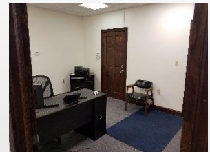
2 nd Floor Offices & Reception